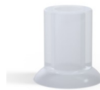
Variant reference: 5 10SLT A