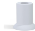
Variant reference: 5 10SLB A