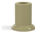
Variant reference: 5 10CN A