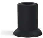
Variant reference: 5 10NI A