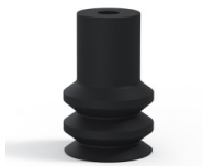
Variant reference: 2 16NI A