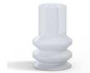
Variant reference: 2 16SLT A