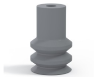
Variant reference: 2 16NR A