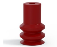
Variant reference: 2 16SL A