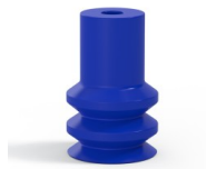
Variant reference: 2 16PU A